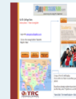
How To Register